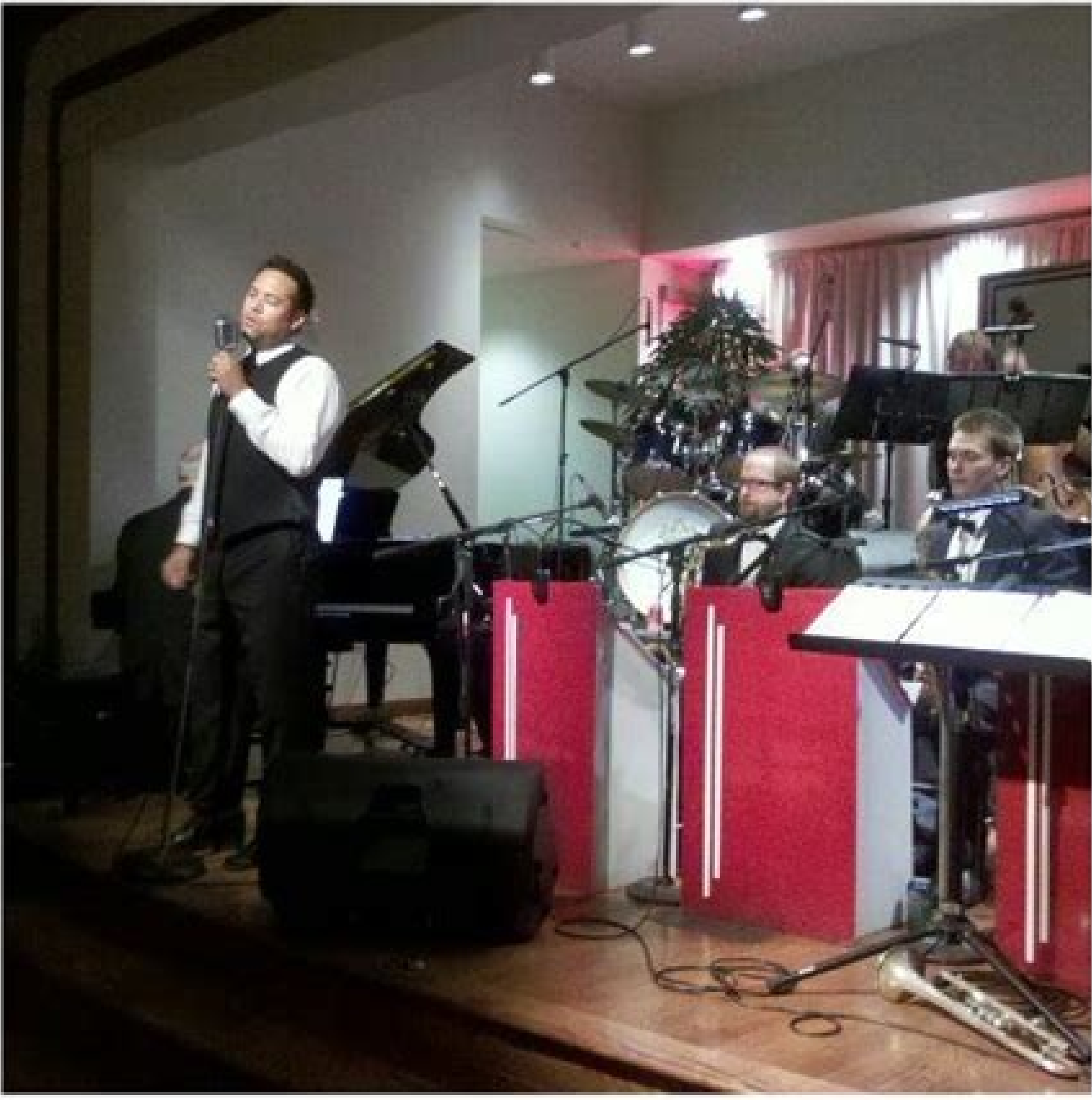
New york staff band members. New bands from new york.